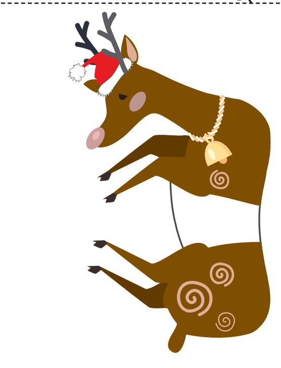
Can You Help Save Christmas?

the elves riding the reindeer to rescue them.